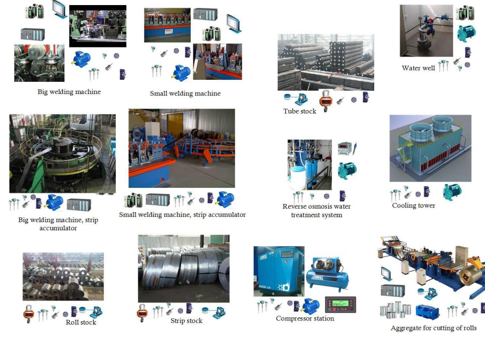
Figure SEQ Figure \* ARABIC 2 Typical manufacturing assets in metal pipe plat operates independantly without real time management of the whole plant as a big system

productivity and efficiency. For example, on average, an overrun of cooling water is statistically ~70-80 cubic meters / month, and an overrun of emulsion concentrate is \sim 0.4 -0.6 cubic month. meters / and electricity ~ 900-1100 kW * h / month, unplanned stops due to for repair and changeover of equipment, 10-12 hours resulting in underproduction of \sim 90-105 tons of pipe products and losses of ~50,000 EUR per month as well as various waste components.