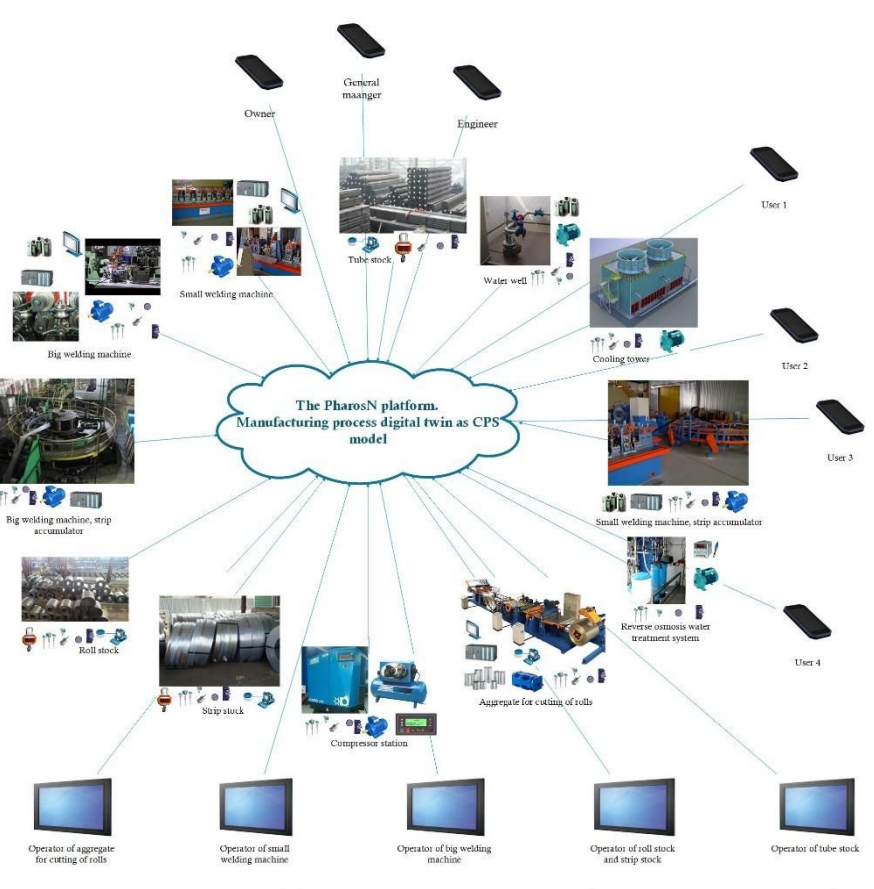
Figure SEQ Figure \* ARABIC 3 Automatic real time monitoring and control of manufacturing processes using industrial CPS running at PharosN platform in cloud

Predicting each state of the production process, possible errors in the operation of the manufacturing assets based on the holistic vision of totality of all current states of the industrial system objects included in the